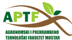
Faculty of Agronomy and Food Technology University of Mostar