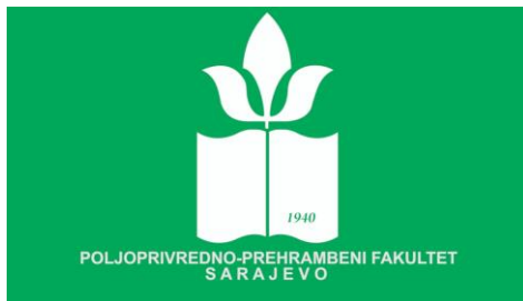
Faculty of Agriculture and Food University of Sarajevo